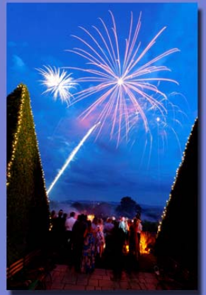
How about fireworks to mark the occasion?