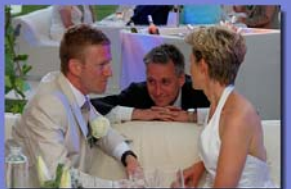
Having a chat during the dinner reception...