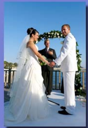
« Weddings that come true... »