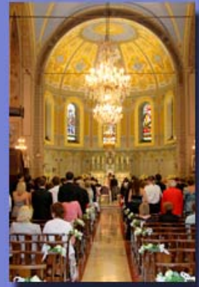
Nothing like a church setting.