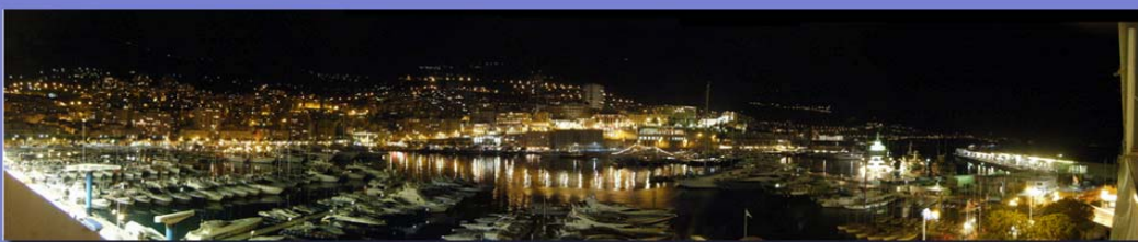
Panoramic view of the Port of Monaco—by night