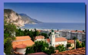
The French Riviera