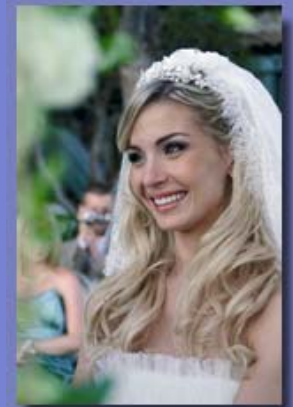
« I do! »