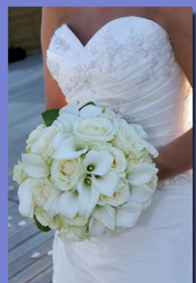
Simplicity & elegance...