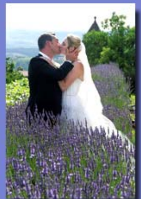
Wedded bliss in a field of lavender...