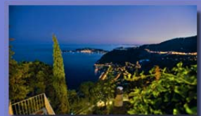
View from Eze at night