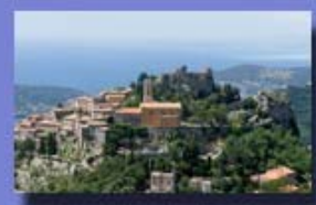
Famous Eze Village